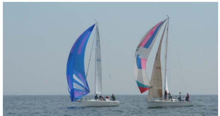
Persistence and Booyaa in the Les Storrs Race

I'm sure there were many volunteers I failed to mention by name, let me say Thank You All.