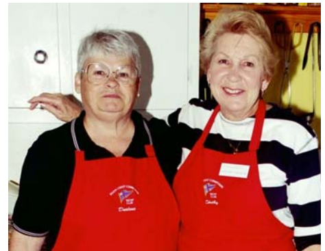
The Ladies in Red