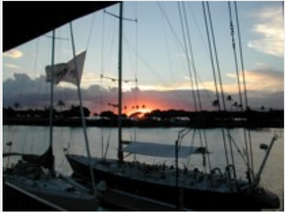
A beautiful sunset at the Hawaii yacht Club with the maxi "Sorcery" when we did Kenwood cup