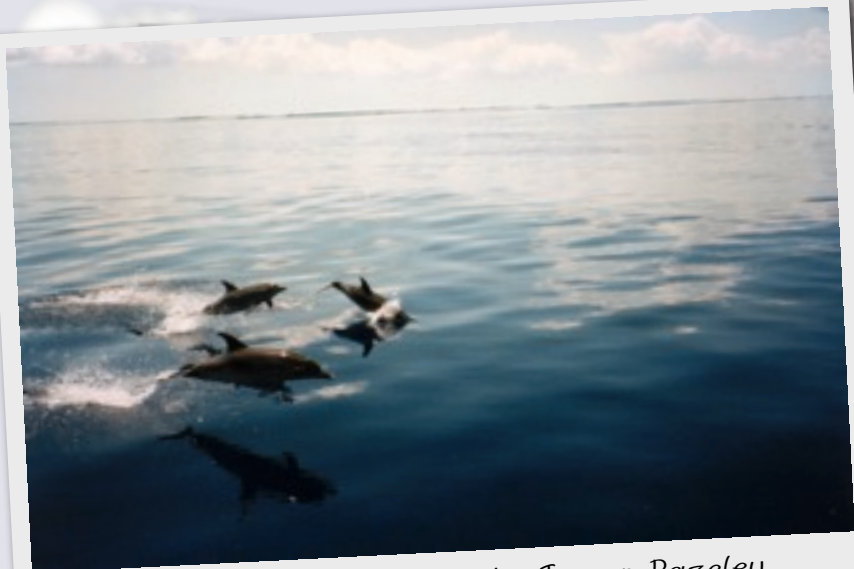
Dolphins just having fun