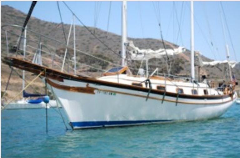
"Free Spirit" on a mooring in Catalina

We have had Free Spirit for nearly 6 months and even though we have had trips to the Channel Islands and Catalina plus numerous day sails we have never been out in winds greater than 5 to 8 knots. At that wind speed she is very comfortable but, as we expected, slow.