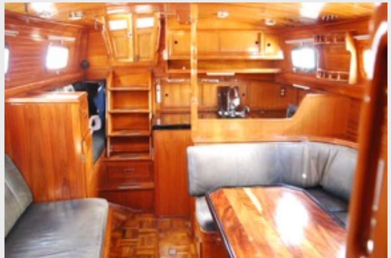
"Free Spirit" interior

I put up the main with one reef and the mizen and headed to the Marina south entrance like a racing car. The boat had a lot of weather helm and I started to think that in high winds 2 reefs in the main, the jib, but no mizen might improve the balance. Already out of the marina I abandoned the idea of unfurling the jib and hit the first waves to start a great roller coaster ride. We (FS and I) were sailing close hauled at 5.5 knots, and on a beam reach at 7 - 8 knots. With the jib we should do even better though the theoretical top speed, based on water line length, is 6.8 knots. The seas were quite big and being on my own for the first time in FS in strong winds and rough seas I did not want change the sail plan even though I wore a life jacket and a safety harness. Also the auto pilot was having difficulty managing the weather helm. Afterwards I realized I had chickened out and wished I had double reefed the main and dropped the mizzen. I stayed out for about an hour with just one Open 570 that was returning as I exited the breakwater and no other boats except a couple in the Marina. I have never seen the bay or Marina so deserted. Later I discover Bruce had been out earlier in Bandit and went back in just before I went out because the winds were up to at least 25 knots! From other observations Bruce collected and readings at UCLA sailing center it appears that I underestimated the conditions and we were in winds of 35 knots or force 8 gale!