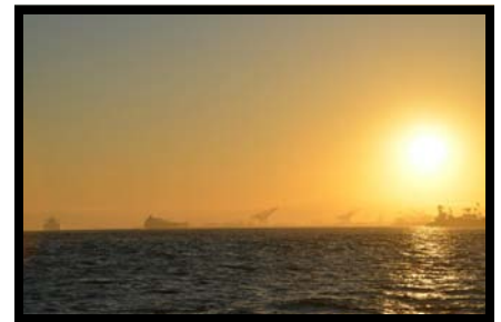
The picture is of the San Pedro oil rigs in the sunset.