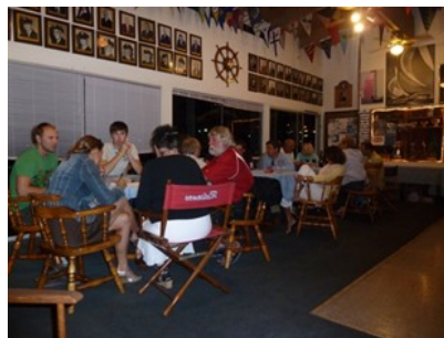
Three of the teams concentrating hard....