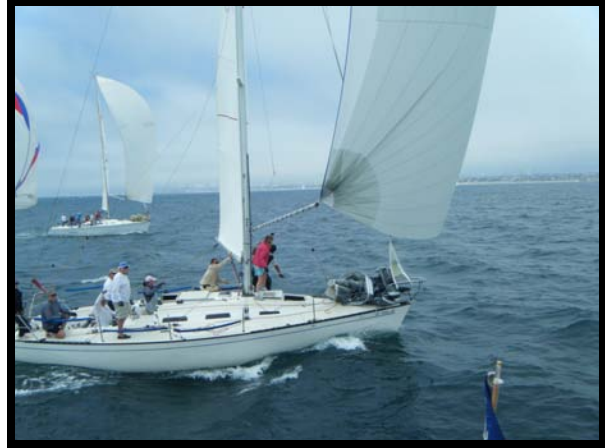
This is one finish in the Schock 35 fleet.