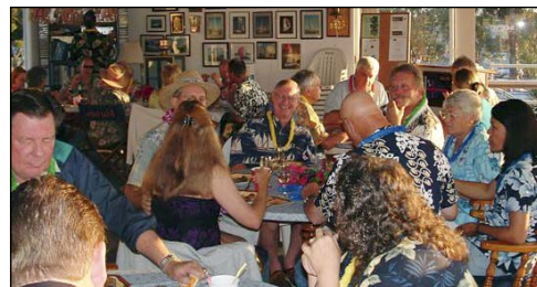
A Full House at the Club House for the Aloha Party