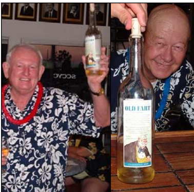
Contestants in the Old Fart Challenge?