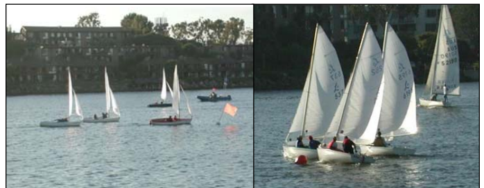
Thursday Night Lidos reaching for the mark and rounding the Mark

There are many other races in July so check your race calendar.