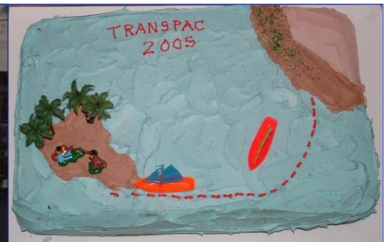
Which is Pendragon and which is Bubala?