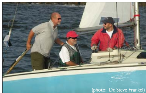
The Bandit Crew on a balmy Wednesday night Sunset Series Race.