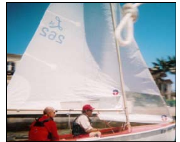
"Bandits" on board

There were 11 boats, three boats in the A fleet and 8 in the B fleet. Any boat with a skipper over 50 was also eligible for the "Grand Master" trophy. One of the boats "Lift" had a combined crew age of 160 years!!