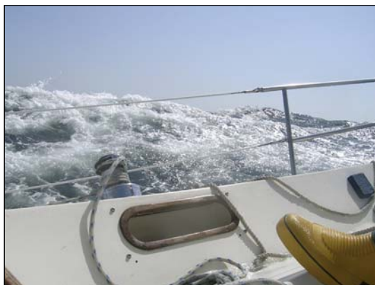
Whitewater finds its way aboard

However the sail from Channel Island harbor to Santa Cruz, the night at Santa Cruz and the sail to Santa Barbara were fantastic and more than made up for the rest of the motor sailing. Anyway we live in California so can sail 12 months of the year and will have our beloved afternoon W to SW 15 knot winds for a lot of the time.