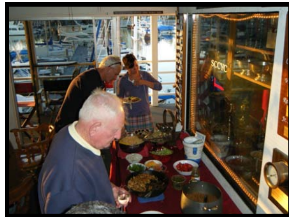
April Membership dinner had about 30 people turn out for beef and chicken tacos. I don't want to brag but almost all the grub was consumed and it cost $110. A little more than $3 per person.