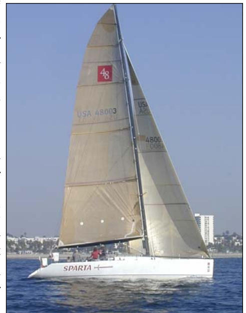
The Sparta Crew on their way to victory in the Campbell Cup Bell Buoy Race