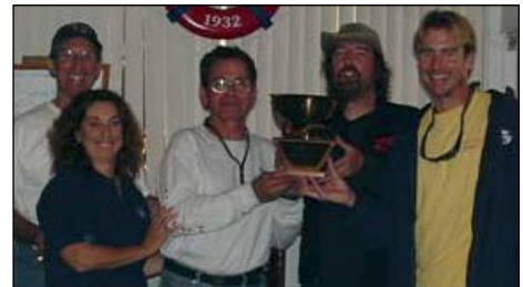
The Sparta Crew accepts their 1st place Campbell Cup showing that size does matter.

This was the last race of the year for SCCYC's race committee and I would like to thank everyone who helped and participated to make our races