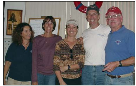
The Bella Crew accepts their 3rd place Campbell Cup finish with aplomb.

This was the last race of the year for SCCYC's race committee and I would like to thank everyone who helped and participated to make our races